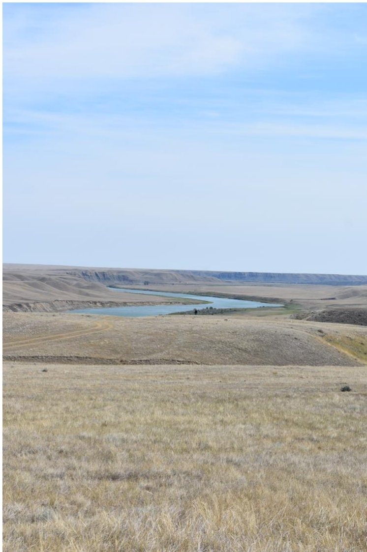
Figure 8. Which signs should we follow?