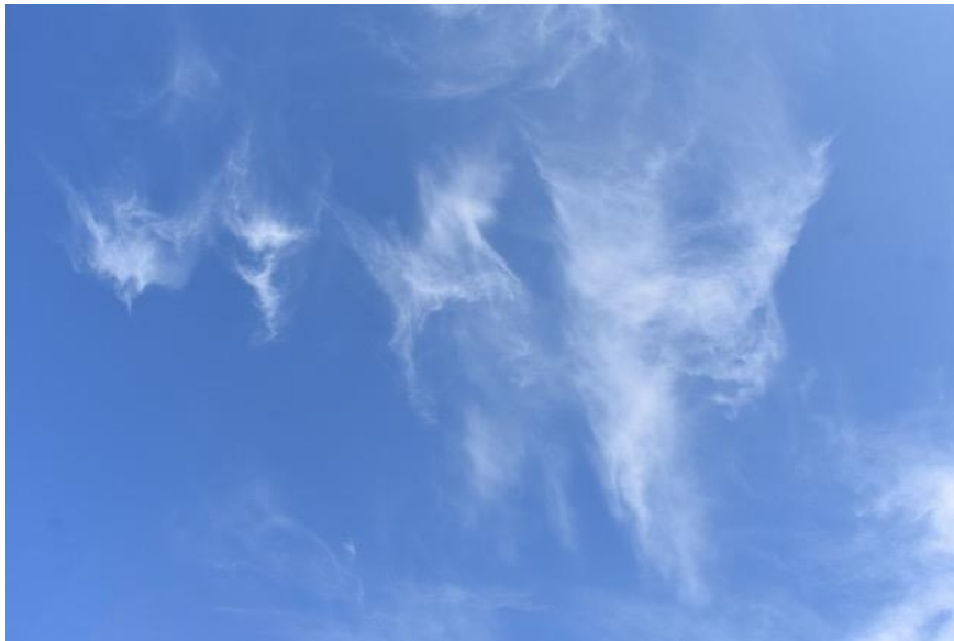
Figure 11. The sky above the medicine wheel.