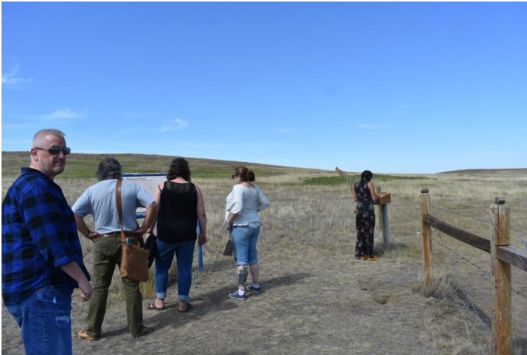
Figure 9. The group apart.

It was only when we opened all the gates and drove through that we eventually found the medicine wheel. We note that on both of our days together, even when it was hard we all showed up, and we all kept trying. We committed to do the work, and to do it meaningfully and with our whole selves. In this moment, we kept nothing back.