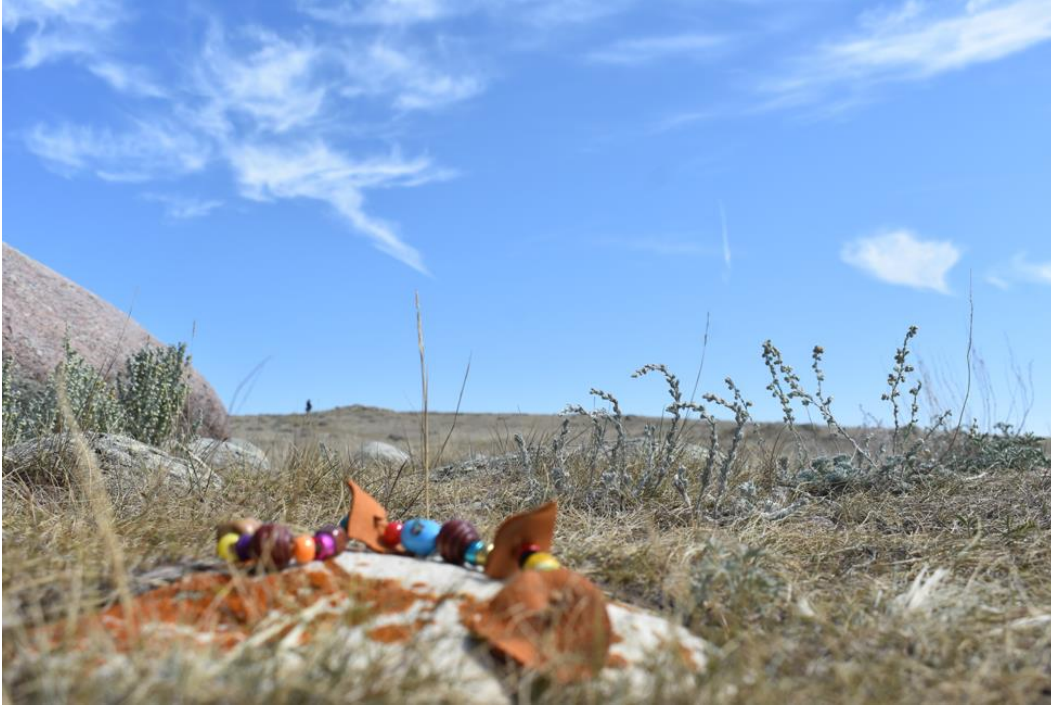
Figure 10. From the west, looking back to the east.

Robin: Coming to the medicine wheel was a personal as well as professional journey. Tim's teachings over these four days and in the months previous provoked something in me that I have trouble describing with words. Lying in the grass at the spot shown in Figure 10, I sang, I cried, I thought of my family and my colleagues at Queen's. I was still.