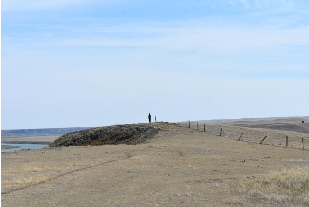
Figure 7. Are we lost?

reality. So, even though I have travelled my own 50%—and much more—I am still willing to travel [towards non-Indigenous people] even more because I know what's at stake.