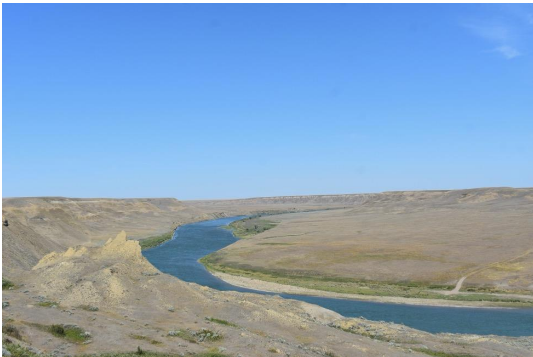
Figure 1. Otahs'niitahtaa/ Bow River 1

decolonization; Indigenization; decoding the disciplines; disrupting interviews