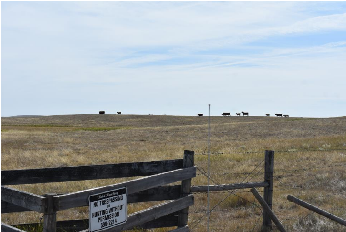
Figure 5. Should we open these gates?

Even with all of the directions we'd gathered, finding the medicine wheel was difficult. In part this was because the route quickly took us off named roads and onto open prairie criss-crossed with rough tire tracks and bounded by various barbed-wire fences with signs and gates (some open, some closed, some locked, some unlocked). We felt the hot August sun on our skin and heard the dry prairie grass crackle under our feet when we left the van to look around. Cows, oil and gas infrastructure, and the occasional piece of farm equipment were scattered across open fields, signs of current economic activity on the land. There were many times over the day when we encountered a closed gate with or without a "No Trespassing" sign and had a long conversation about whether to open it and drive through. Sometimes we did, sometimes we didn't.