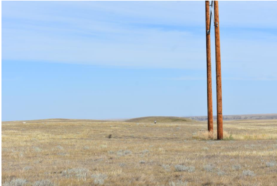
Figure 6. What is the right path?