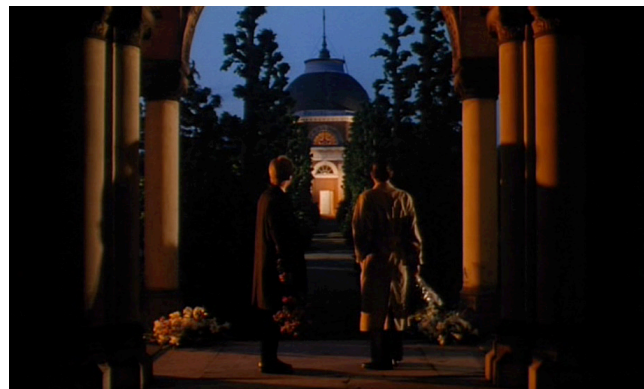
Figs. 3 & 4 | A Muybridgian perspective of the Deuce brothers. The shots appear to be the same time from different angles. A Zed and Two Noughts .

Greenaway's use of nudity is not intended as eroticism but to inform the viewer that this is the actor/model without costume and therefore without context.