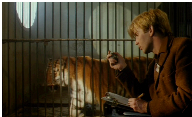
Figs. 1 & 2 | A Zed and Two Noughts begins with twin brothers Oliver and Oswald Deuce photographing animals in motion, like pseudo-Muybridges, moments before their wives' deaths.