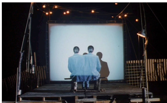
Fig. 10 | Siamese-twins, Oliver and Oswald, suggest cinematic Siamese-twins Peter Greenaway and Eadweard Muybridge, watching a blank movie screen: the purpose of not serving a purpose in A Zed in Two Noughts .

No longer having to conform to the linear medium of film, the elements of a database are spatialised within a museum, in this case a zoo – Muybridge's zoo.