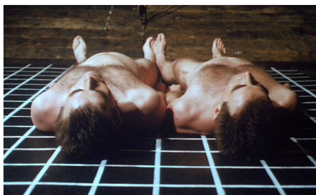
Fig. 6 | The Deuce brothers' final photographic series in A Zed and Two Noughts .