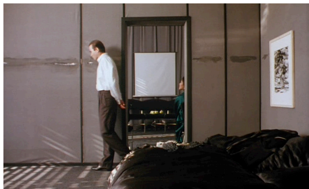
Fig. 8 | Oswald's repetitive Muybridgian x-axis walk rots his wallpaper and leaves a trail of ooze in A Zed and Two Noughts .

Greenaway depicts the brothers as emotional in the start of the film; however, that quickly changes, and their emotions and their actions lose context as they walk and jog in Muybridgian fashion toward their suicide. Their actions do not appear linear but scattered and can be read by the viewer horizontally, vertically, and diagonally as they perform nude and semi-nude in the film frame. Greenaway's Deuce brothers only function is to procreate and die; all their actions in between those two