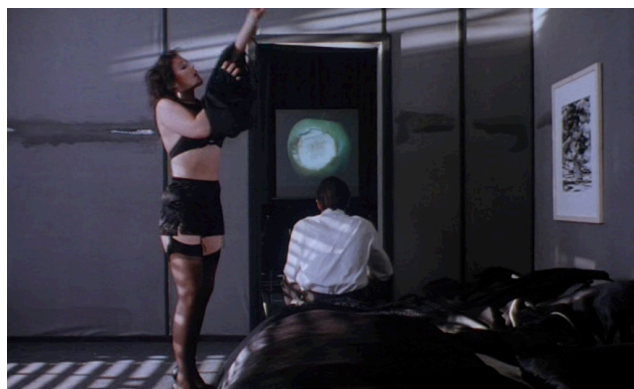
Fig. 9 | A rotting apple projected beyond rotting wallpaper and the recreation of a Muybridgian semi-nude model in A Zed in Two Noughts .