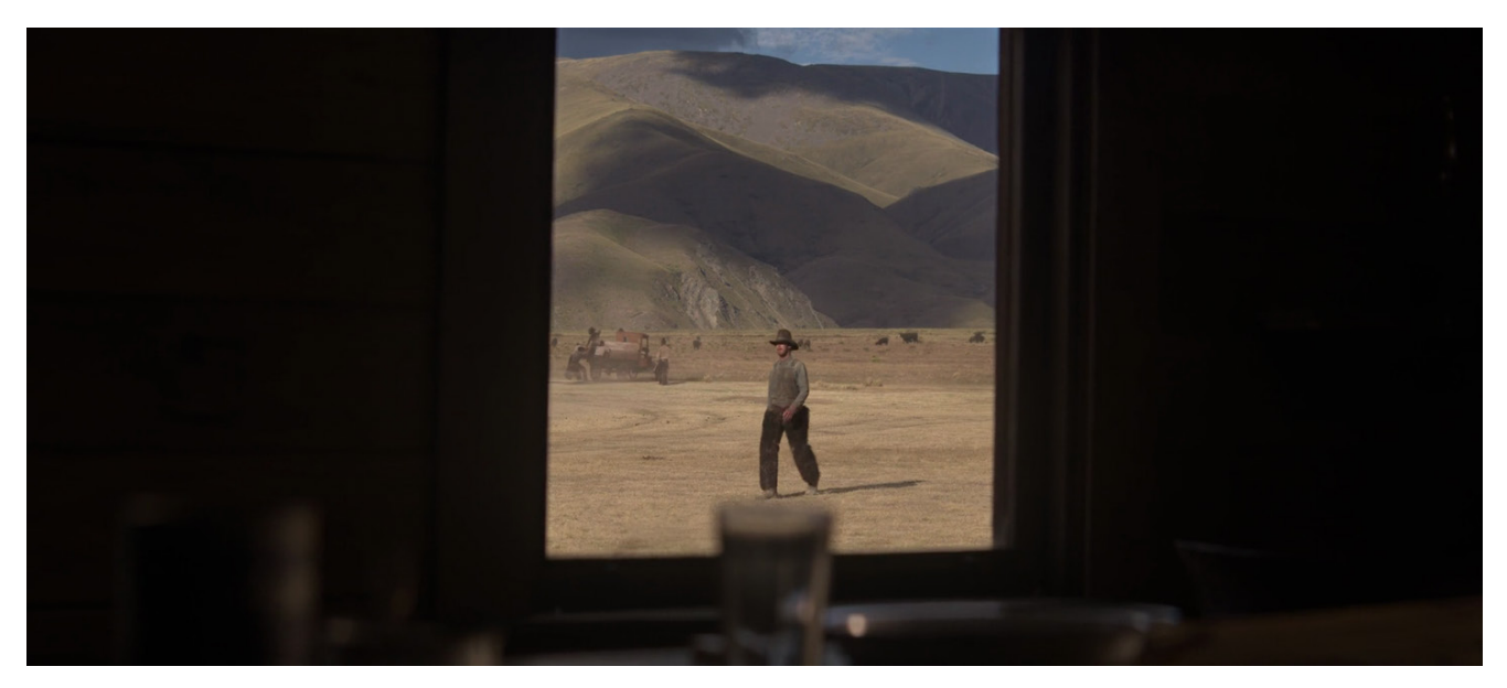
Fig. 1 | Phil framed by the ranch window in The Power of the Dog , 00:01:51. Netflix, 2021.