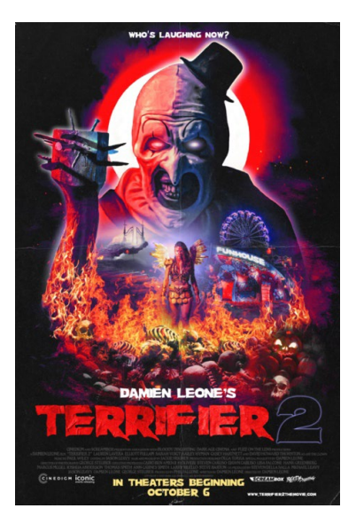
Fig. 9 | Promotional poster for Terrifier 2 . Dark Age Cinema, 2022.

white, heterosexual, and Hollywood-based was part of the process, one we were actively engaged in as a part of this panel. After all, Mulvey's critical article did not consider that the spectator is not necessarily white, heterosexual, or male, and that the female spectator might respond with anger and resistance to her portrayal onscreen by writing, speaking, acting, or directing.