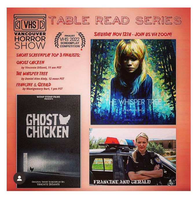
Fig. 5 | Promotional image for the Screenwriting Table Reads. VHS, 2022.