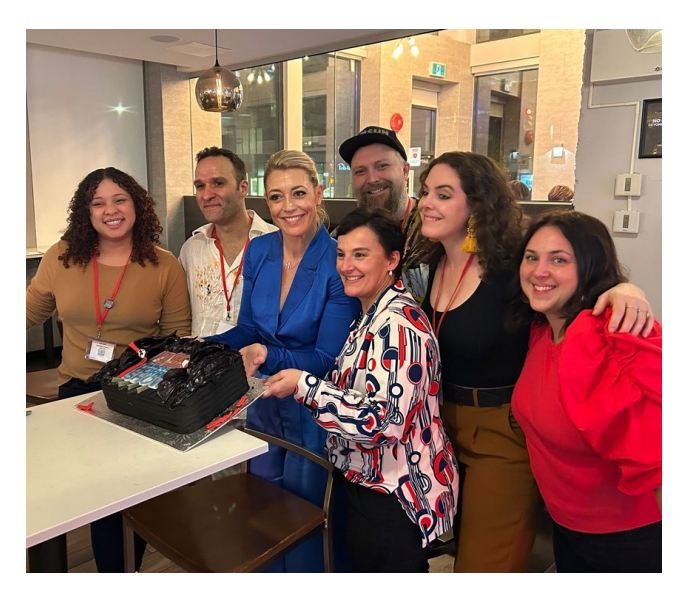
Fig. 10 | The VHS team celebrates opening night on Nov. 5, 2022.

In it, Art the Clown (David Howard Thornton) returns to the timid town of Miles County where he targets Sienna (Lauren LaVera), a teenage girl, and her younger brother on Halloween night. It has the VHS tape vintage feel of a slasher B film from the 70s or 80s and is a surrealist slasher nightmare that recalls the blood and gore from grindhouse films. This film revels in pushing the envelope, with one particular bedroom scene that ostensibly led some viewers to vomit or faint. The unspeakable murders of Art the Clown, face frozen in a maniacal grin of teeth and black greasepaint and enacted in complete laughing silence, are enacted across race and gender, but it is still women who bear the brunt of his attentions and with relentless screentime. Sienna is positioned as Art's nemesis, a warrior angel, a light to his darkness (and LaVera fills the role surprisingly well), but she is still the final girl we see through the lingering eye of the camera as it pans over her scantily clad, muscular body for the benefit of only some spectators. Not even entrenched in the gender flux of masculinization usually ascribed to the final girl, Sienna is infantilized in her opening nightmare and sexualized in the film's living one, despite her heroic confrontation with the clown. There are very effective and surreal moments of levity and even hilarity in the film, largely due to Art's expressive pantomime in every situation and some of the campier gore sequences, but laughter and