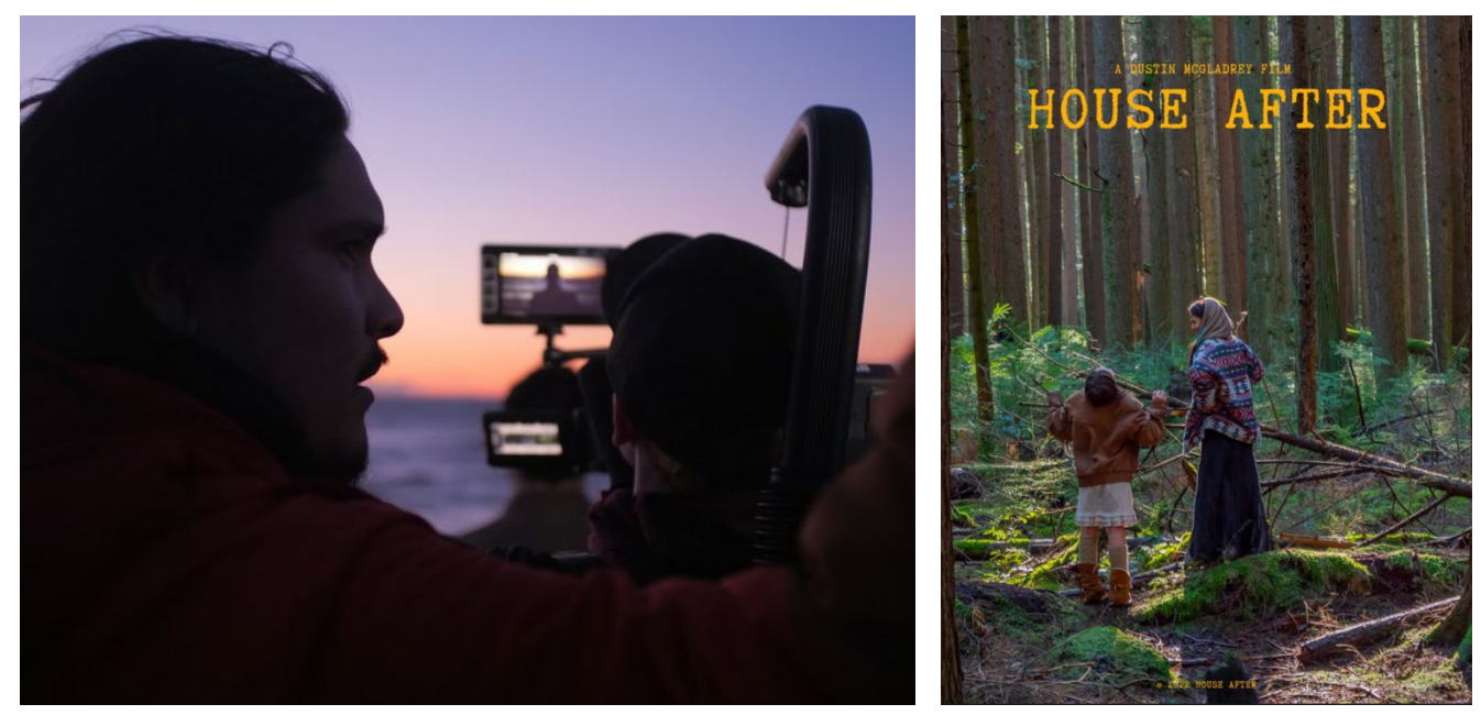
Fig. 3 and 4 | Dustin McGladrey and House After. Student short film, 2022.