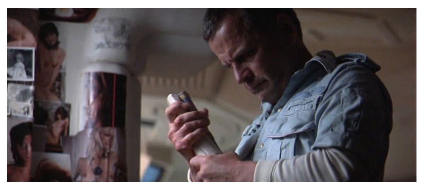
Fig. 2 | The pornographic images of women on the wall as Ash prepares to assault Ripley in Alien, 01:22:26. Twentieth Century Fox, 1979.