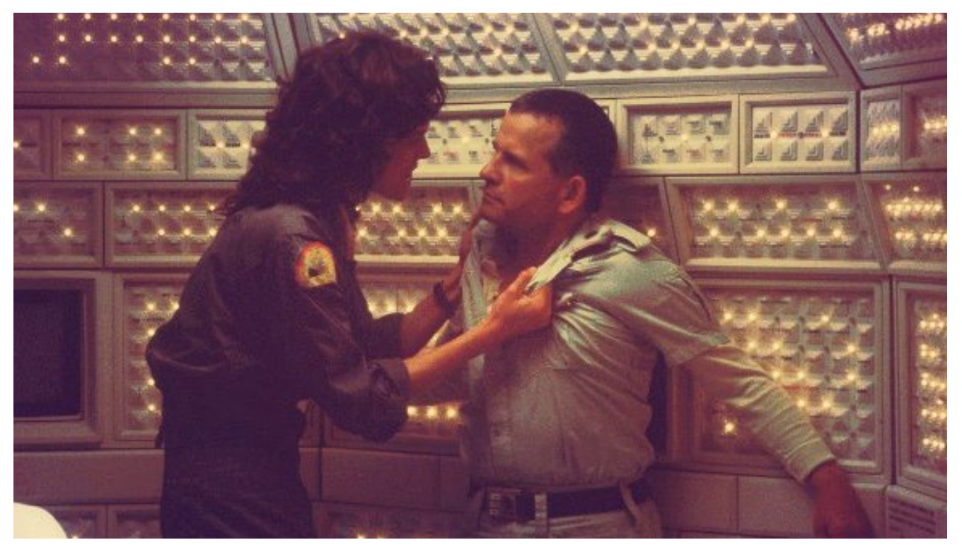
Fig. 1 | Ripley aggressively questions Ash in Alien, 01:20:13. Twentieth Century Fox, 1979.

noticing its tributes to Alien. Set in 2231, the novel opens in medias res, where a crew of thirteen on a botany expedition must also face a deadly alien. In addition to the primal terror of being slaughtered by a "foreign biological," both works also explore women's fears of being sexually assaulted. These anxieties remain with women everywhere: in public, in their homes, and even in the workplace. There is no location in which women are completely safe.