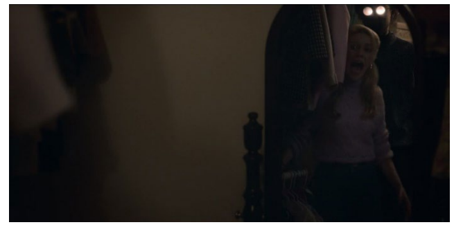
Fig. 6 and 7 | The fear of sexuality is projected onto the fear of spectrality, 00:48:48; 00:49:01. "The Great Good Place" (The Haunting of Bly Manor). Netflix,

By using a nocturnal plant to illustrate a lesbian relationship in the 1980s, The Haunting of Bly Manor alludes to the contemporary attitude surrounding nonreproductive families.