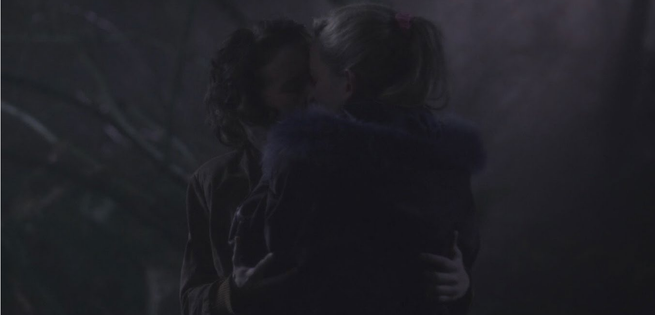
Fig. 3 and 4 | A symbolic representation of Dani's liberation, 00:34:49; 00:34:53. "The Jolly Corner" (The Haunting of Bly Manor). Netflix, 2020.