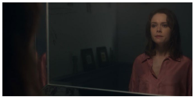
Fig. 9 and 10 | Dani's fear of a spectral presence is contrasted with Jamie's grief over its absence, 00:35:33; 00:39:46. "The Way It Came"; "The Beast in the Jungle" (The Haunting of Bly Manor). Netflix, 2020.

gardener would gaze into reflections, hoping to see [Dani's] face," as the spectre is now a desired presence rather than a source of terror (authors' emphasis, "The Beast in the Jungle," Figs. 9 and 10).