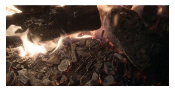
Fig. 8 | In "The Way It Came" (The Haunting of Bly Manor), Dani renders herself a threat to the hetero-patriarchal system embodied by Edmund's gaze, 00:49:36. Netflix, 2020.