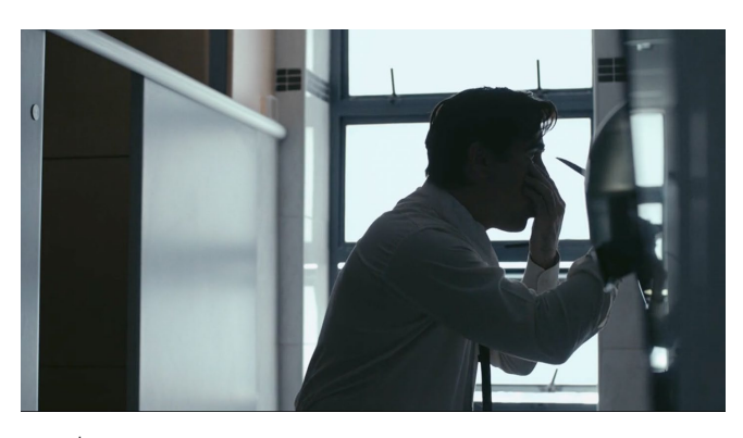
Fig. 6 | A medium shot of David with the knife in his hand, 01:48:50. Film4, Screen Ireland, 2015.