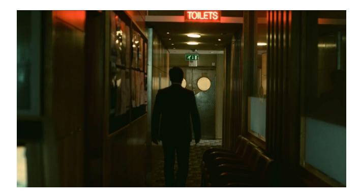
Fig. 4 | The corridor, 01:48:03. Film4, Screen Ireland, 2015.