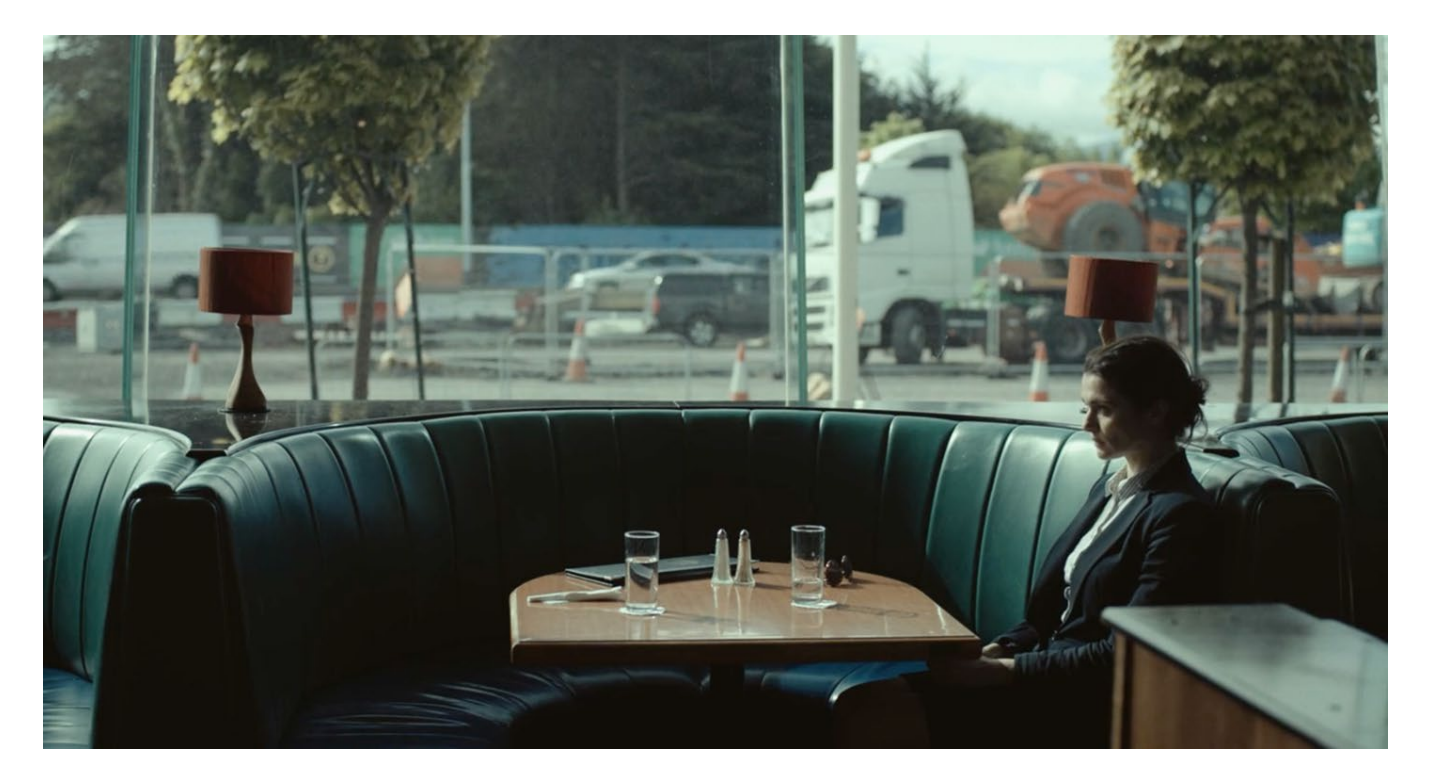
Fig. 7 | The final shot, 01:49:00. Film4, Screen Ireland, 2015.

government— is doing it to him. He wants to be with someone he loves, but he cannot unless he blinds himself.