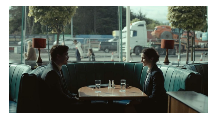
Fig. 3 | A medium two shot of David and Shortsighted Woman, 01:46:45. Film4, Screen Ireland, 2015.

The camera cuts to a medium shot of David with the knife in his hand (Fig. 6). He picks up some tissues and puts them in his mouth. The natural backlighting renders his face dark and undetectable. His face is seen in the mirror as well. When he raises his hand to put the knife in his eye, his hand is masked by the tissue holder. We only see the tip of the knife pointing at his eyes, as if someone else—perhaps society, culture, the law, or the