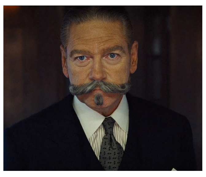
Fig. 11 | Poirot's Moustache, 42:22:00. 20th Century Fox, 2017.