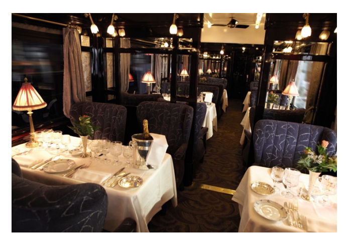
Fig. 4 | Restored Dining Car of Venice-Simplon Orient Express. Luxury Train Club.