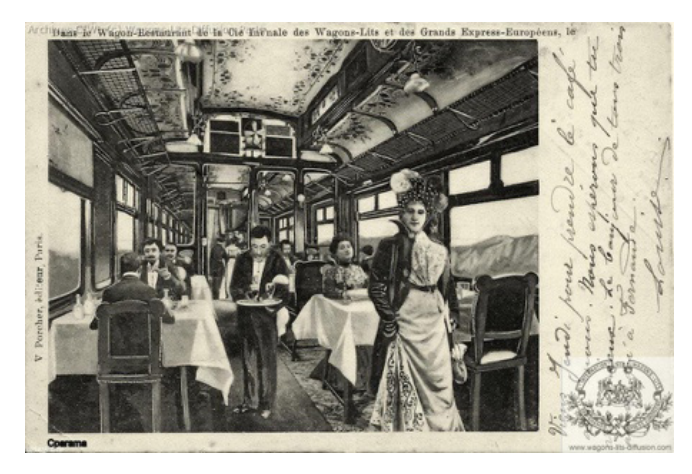
Fig. 3 | Dining Car of CIWL Train circa 1906.