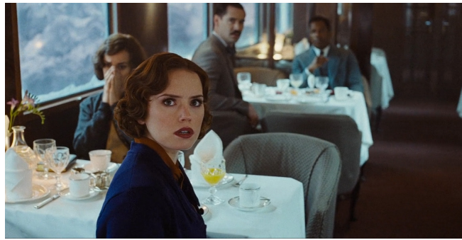
\label{eq:Fig.5.6.6} \textbf{Fig. 5 \& 6} \mid \text{Hector MacQueen (Josh Gad) and Mary Debenham (Daisy Ridley) meet} \\ \textbf{Poirot's gaze, } 41:46:00/41:57:00.20th Century Fox, } 2017.