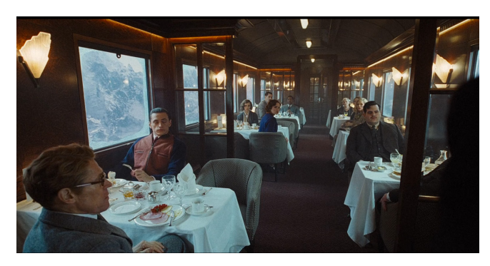
Fig. 2 | Establishing shot, 41:33:00. 20th Century Fox, 2017.

In Branagh's choice for Poirot's moustache, his attention to detail and authenticity can be seen, as well as his homage to the original hypotexts (Fig. 11). In the hypotext upon which the film is based, Agatha Christie's Murder on the Orient Express, the tenth Poirot novel, Poirot's character is already established and is