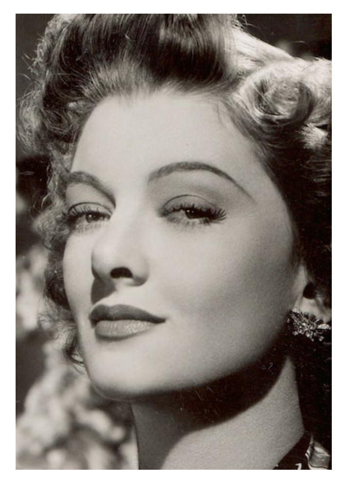
Fig. 7 | Myrna Loy. Turner Classic Movies.