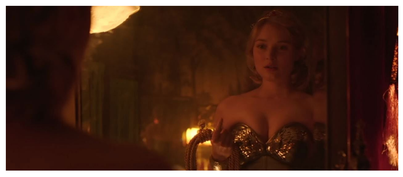
Fig. 4 | Byrne transforming into Wonder Woman, Professor Marston, 1:10:48. Opposite Field Pictures, 2017.

strength (1:38:17) (Fig. 5). It takes a lot of strength to admit being wrong as well as professing love for another person, especially if that relationship may be judged by outsiders.