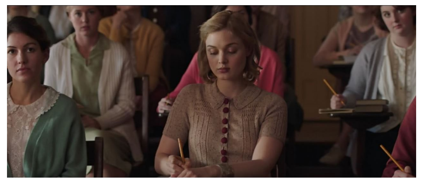
Fig. 3 | Byrne's more feminine style of clothing, Professor Marston, 02:52. Opposite Field Pictures, 2017.

to wear them more often. Choosing to apply specific materials and tones adds a second layer to Holloway's masculinity and Byrne's femininity.