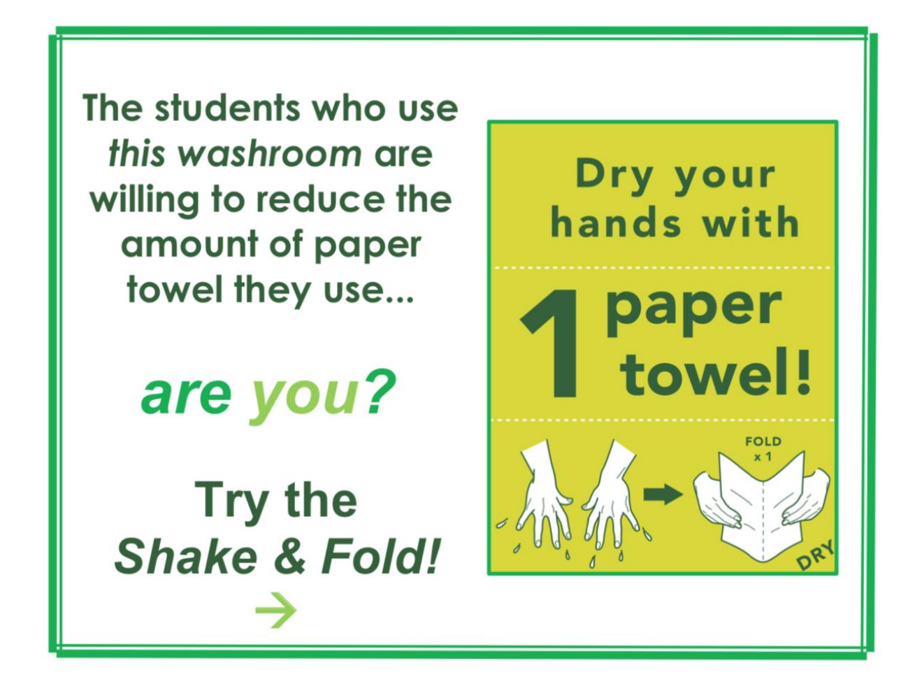
Figure 1. The Signs Posted on Paper Towel Dispensers in Experimental Washrooms During Treatment Weeks