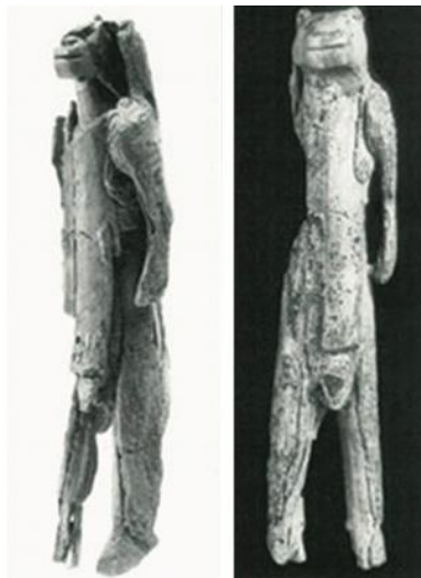
Figure 3. German statue of a lion-headed person. This 32,000-year-old figure demonstrates that humans used their working memory to show their imagination externally, as well as original thought to create non-existent creatures. (Wynn & Coolidge, 2011).